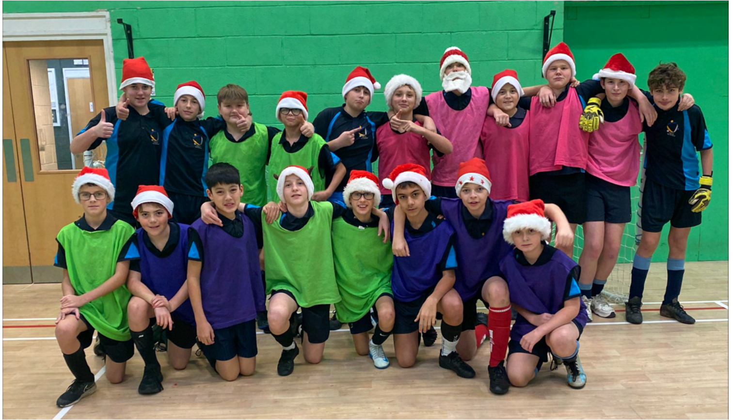
Mistletoe Mavericks:18 Points, Jingle Ballers:11 Points, Winterwonderlanders:11 Points, Tinsel Town:9 Points